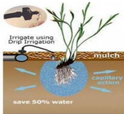
Fig. 1. Drip Irrigation at Root Zone

amount of water and the intermediate area between crop rows remains dry and receives water only from incidental rainfall. In order to solve this problem the drip or trickle irrigation [8,11] is used which is a type of modern irrigation technique that slowly applies small amounts of water to part of plant root zone