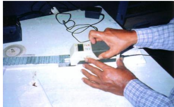
Fig-2 Measurement of surface roughness