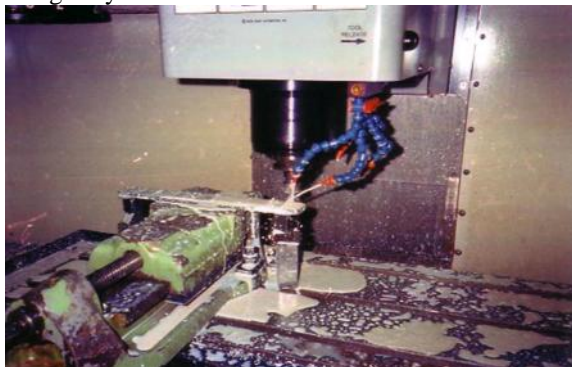
Fig-1 Machine set up

The experiments were conducted as per the standard orthogonal array L_{16} (4^5) as shown in table.1 with 4 level 5 factor design. The process parameters selected were cutting speed, feed rate, depth of cut, and cutter diameter. HAAS-VF2 CNC machining centre with 10,000 rpm spindle speed, 1000 IPM vector dual drive being used for experimentation. Fig-1 shows the machine set up for conducting experiments. Table-2 indicates the factors and their values. The cutting tools used for experiment were HSS end mills with required number of cutting edges. Aluminum metal matrix composite was selected as a material for present study. The response to be studied was surface roughness ( R_a ). Talysurf was used to measure R_a values of work surfaces in random order at 3 places and average of these values was recorded. Fig.2 shows the measurement of surface roughness using Talysurf.