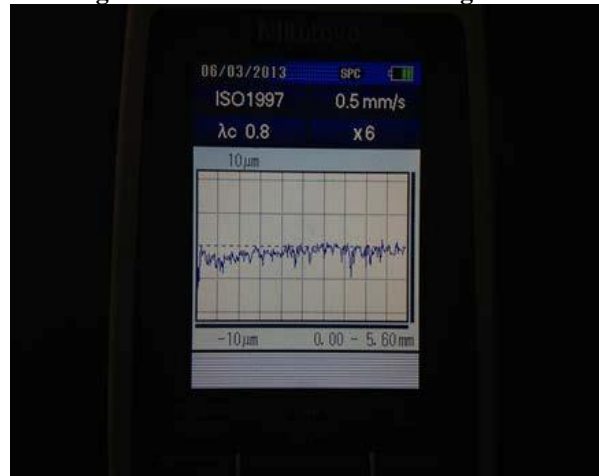
Fig-3: Surface Roughness Illustration

The mathematical relationship between responses and machining parameters was established using the multiple regression analysis. In the present study, the correlation between the process parameters cutting speed, feed rate, depth of cut, number of cutting edges, step over distance and surface roughness are established.