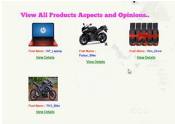
Fig-2 :View all products aspects and opinions