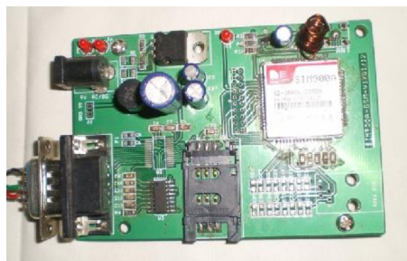
Fig: 4 GSM Module

number. Advantage of using this modem will be that you can use its RS232 port to communicate and develop embedded applications. Applications like SMS Control, data transfer, remote control and logging can be developed easily.