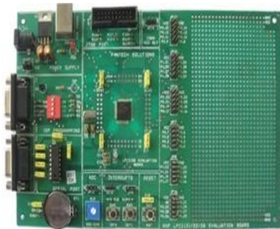
Fig: 2 ARM7TDMI PCB board