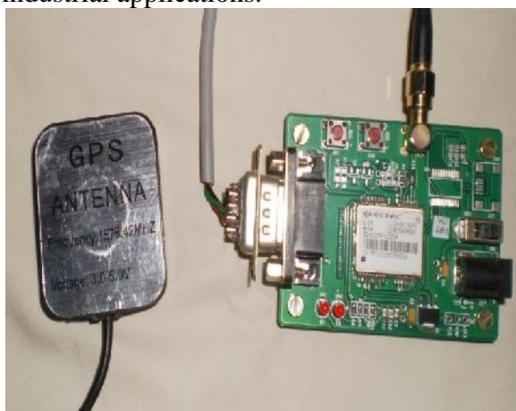
Fig: 3 GPS Module

The GPS module L10 brings the high performance of the MTK positioning engine to the industrial standard. The L10 supports 210 PRN channels. With 66 search channels and 22 simultaneous tracking channels, it acquires and tracks satellites in the shortest time even at indoor signal level. This versatile, stand-alone receiver combines an extensive array of features with flexible connectivity options. Their ease of integration results in fast time-to-market in a wide range of automotive, consumer and industrial applications.